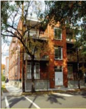
Thanks to FamilyLinks initiatives like the new Kelly Street Apartments (shown above), families reunite and rebuild.

FamilyLinks has a history that spans more than 80 years in the delivery of quality social services to Allegheny County residents.